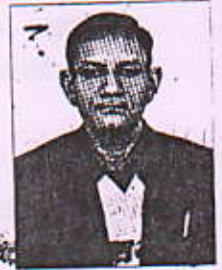
सत्यमेव जयते रस्तावेज विभाग उत्तराखण्ड